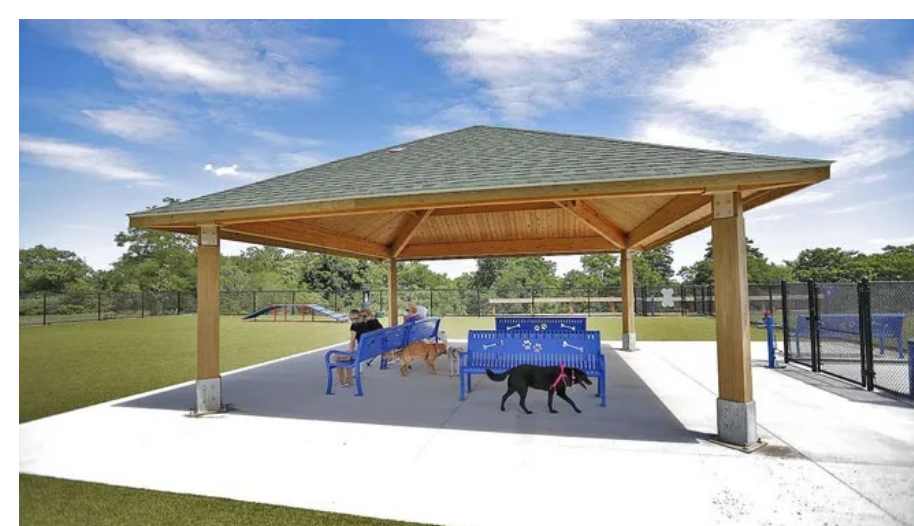
Shade Structure Concepts : Above Tower Hill Botanical Garden, and the Quarry St. Quincy, MA Dog Park shade structures