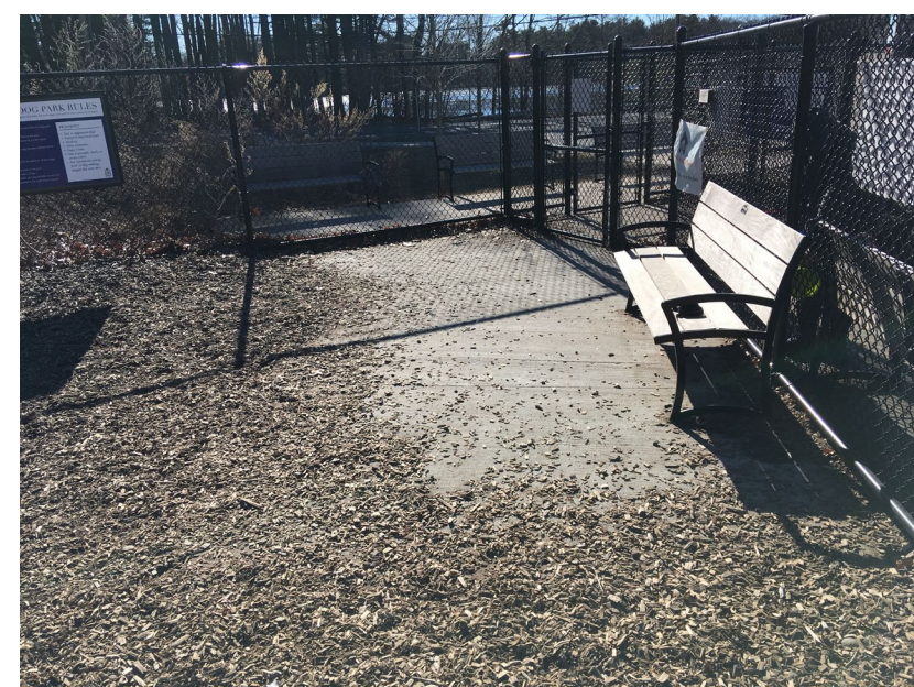
Entry area with Bench - Engineered Wood Fiber