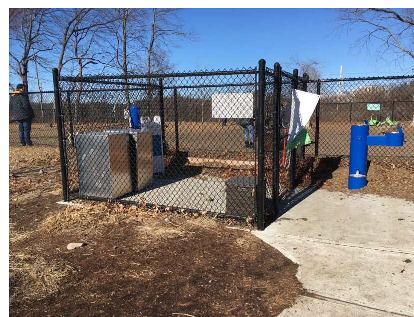
Entry area with Fountain and storage area