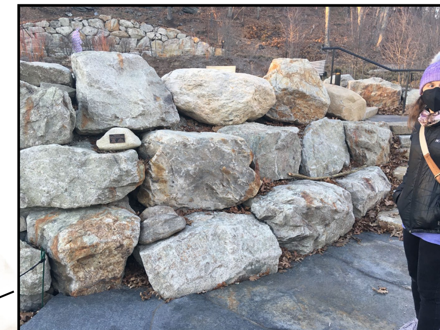
Salvaged boulders to be used on site in a similar manner. The wall above is at Tower Hill Botanical Gardens.