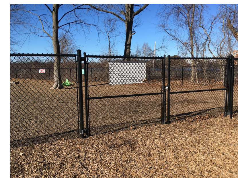
Service access gates