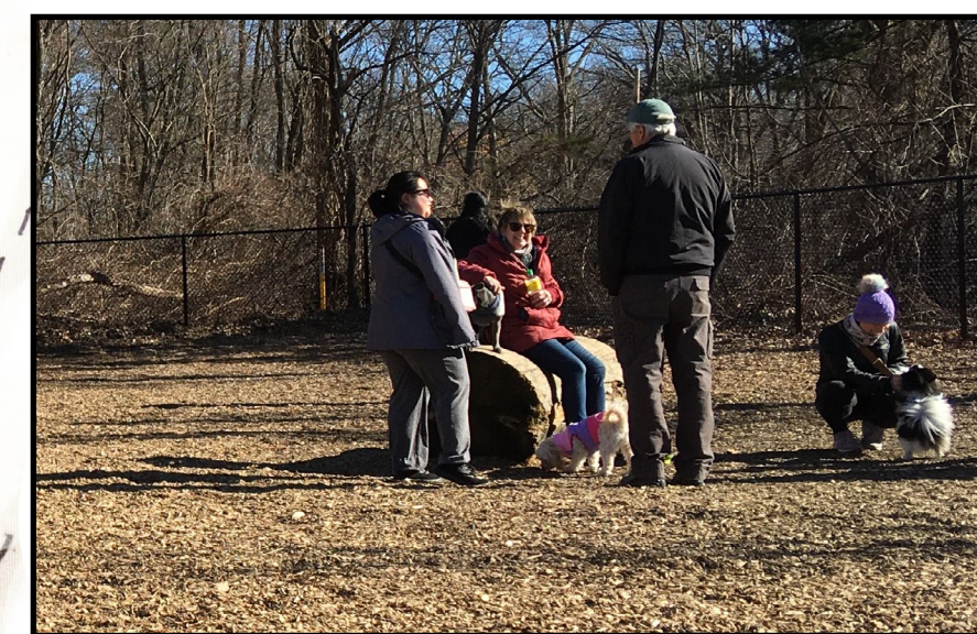
Dog Park - community of 'small dog' owners sitting on a large log 'Eddie Dog Park', Natick, MA

Nature trail through the woods loops back to the Senior Park